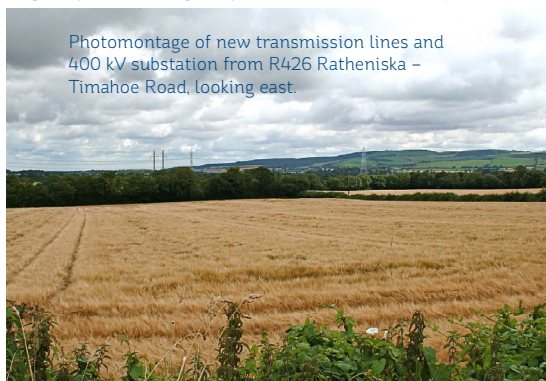
Photomontage of new transmission lines and 400 kV substation from R426 Ratheniska - Timahoe Road, looking east.

http://www.eirgridgroup.com/the-grid/projects/laois-kilkenny/whats-happening-now/