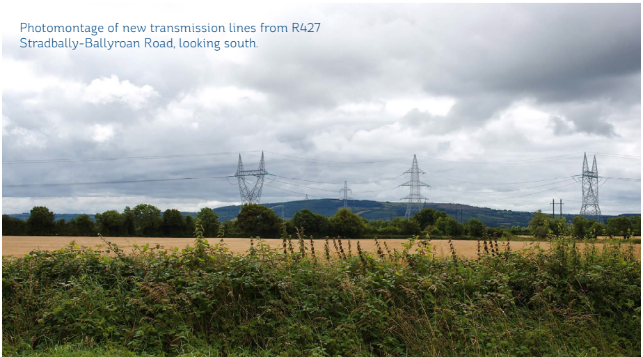
Photomontage of new transmission lines from R427 Stradbally-Ballyroan Road, looking south.

Contact us: lkproject@esbnetworks.ie or call 057-8665718 (lines open Monday to Friday, 9am to 5pm)